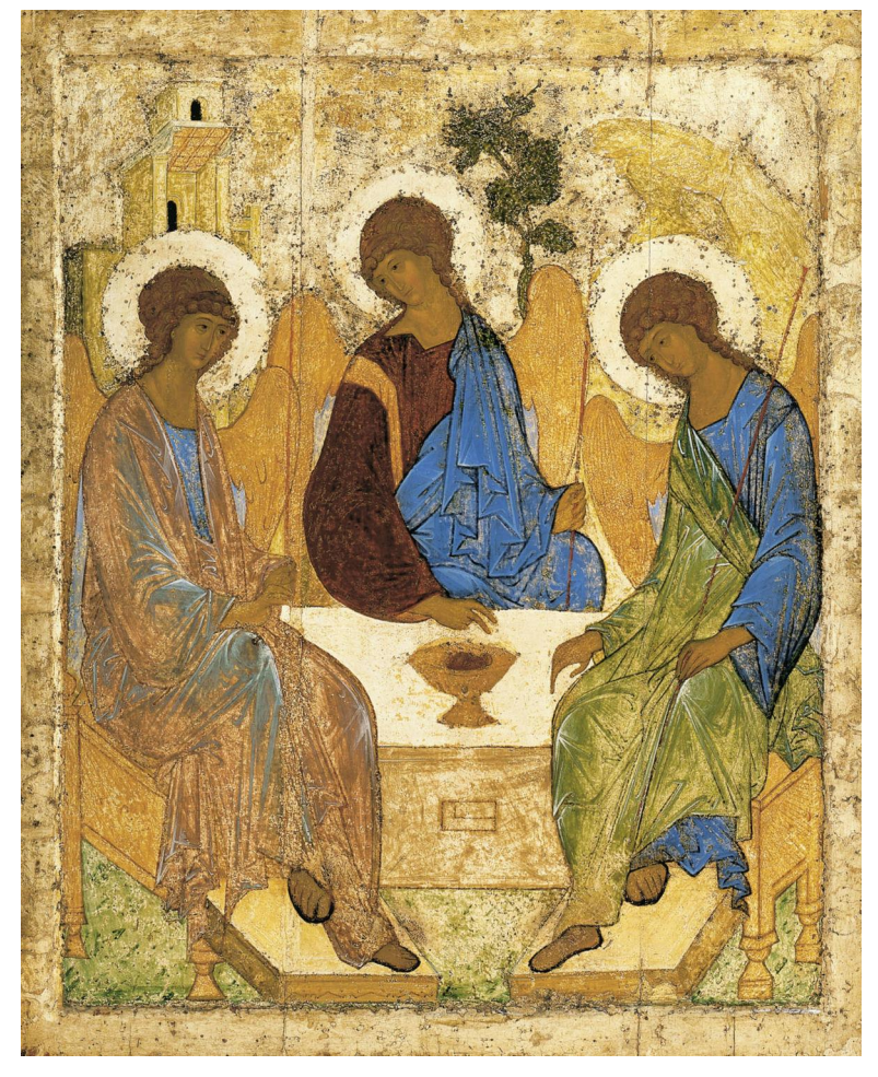
The Trinity by Andrei Rublev