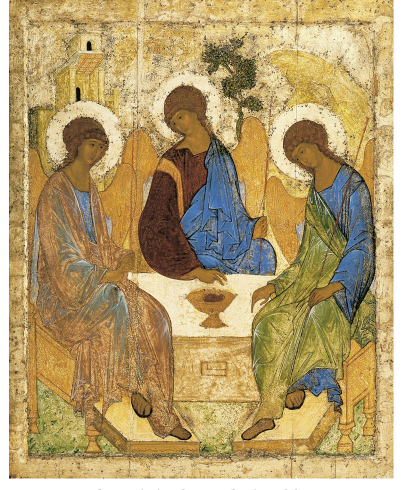
The Trinity by Andrei Rublev