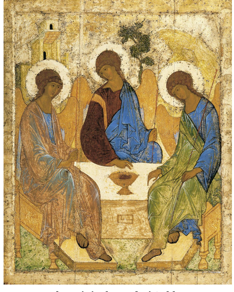
The Trinity by Andrei Rublev