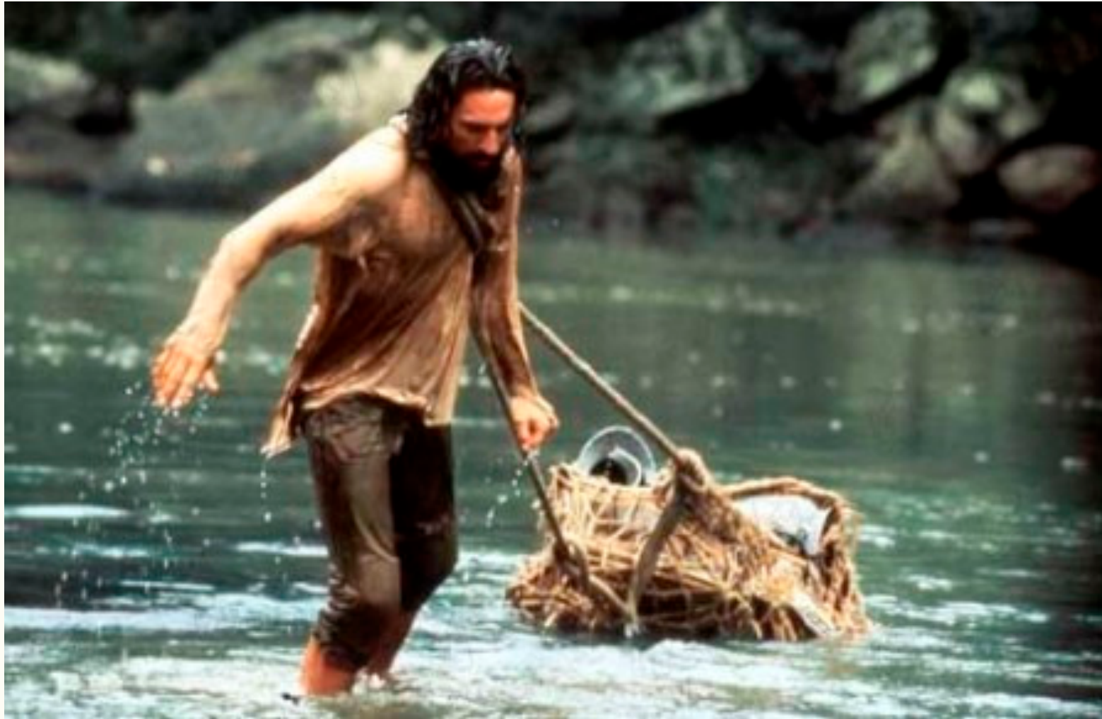
The Mission, 1986